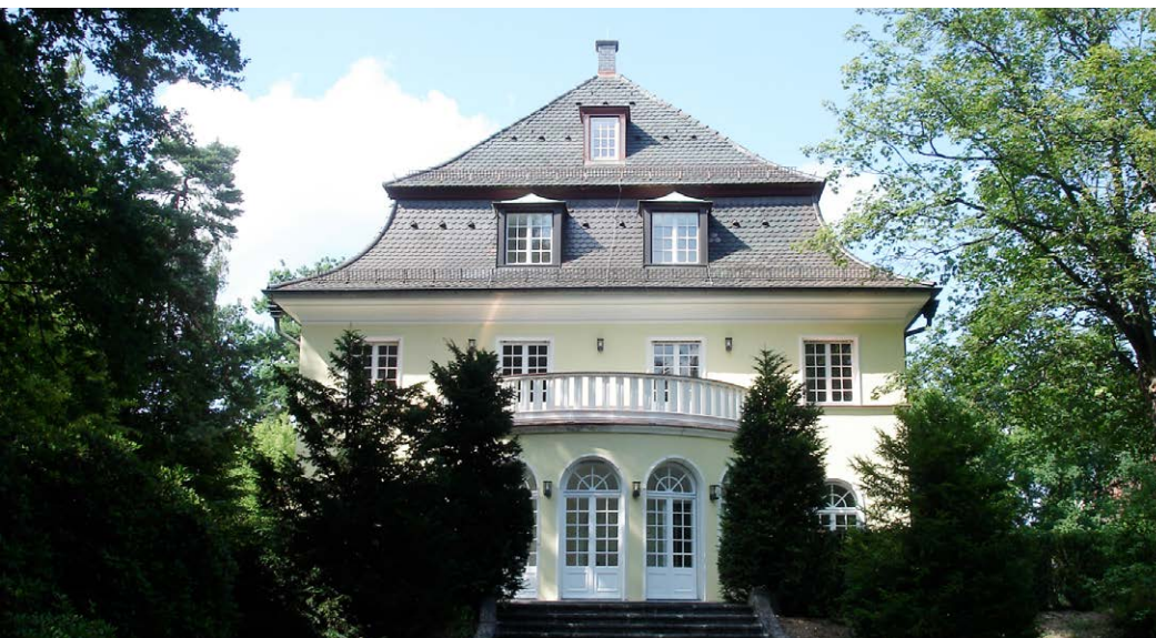
ISO headquarters in Nuremberg – a monument protected building

Some 620 permanent employees work at several sites throughout Germany as well as at associate companies in Austria, Poland and Canada. The ISO Software Systeme, ISO Travel Solutions, ISO Professional Services and ISO Public Services are all certified to the requirements of their quality management system in accordance with DIN EN ISO 9001:2015.